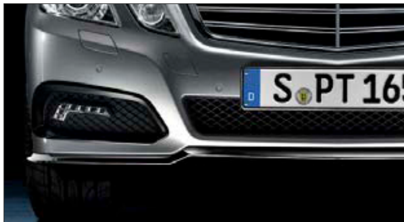
A larger, more dynamic look: Daytime driving light trim in matt black and front spoiler lip [pictured above and on right-hand page]

MercedesSport adds to the visual appeal of your E-Class. The styling components are intelligently designed, and the consistent use of cutting-edge computer technology enables precise, high-quality manufacturing. Using the original vehicle data when developing the individual elements also assures an optimum precision fit.