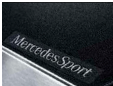
Velour MercedesSport mats High-quality sporty look, black with contrasting stitching. MercedesSport lettering on front mats. Set of 4