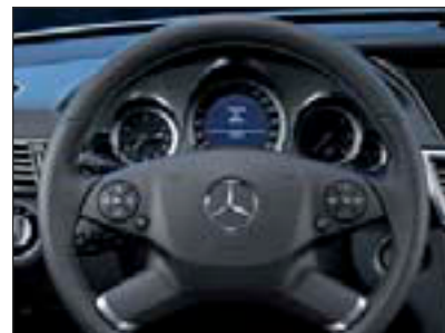
Sports steering wheel Perforated black leather. With shift paddles and heating as an option