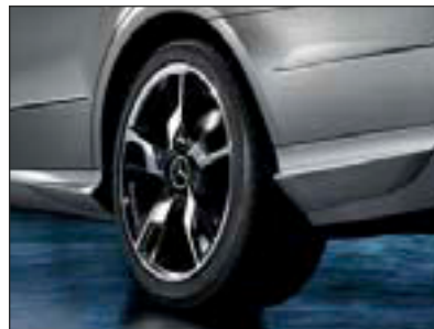
Side sill panels Primed.* Set of 6