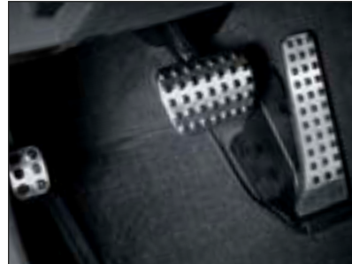
Stainless steel-effect pedal covers A C With non-slip stud inlay