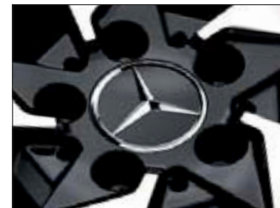
Hub cap Black, high-gloss, with chrome star