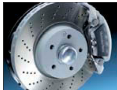
Braking kit Consisting of internally ventilated, perforated brake discs and brake callipers with Mercedes-Benz lettering