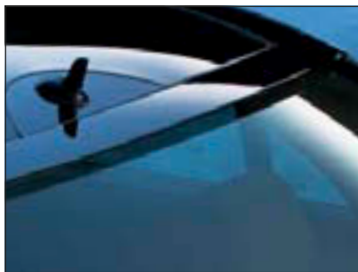
Roof spoiler Primed*