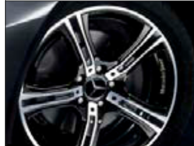
5-spoke wheel, black/two-tone A C 45.7cm (18-inch). Available with or without MercedesSport lettering