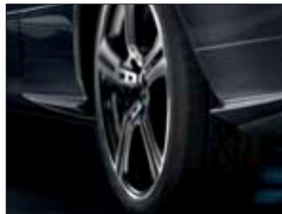
Side sill panels Primed.* Set of 6