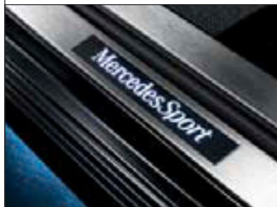
Door sill panels, front panels illuminated Ground stainless steel. 6-piece set