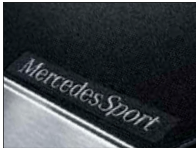
Velour MercedesSport mats W S High-quality sporty look, black with contrasting stitching. MercedesSport lettering on front mats. Set of 4