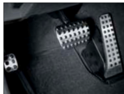
Stainless steel-effect pedal covers With non-slip stud inlay