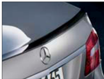
Rear spoiler Primed*