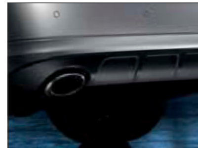
Diffuser-look rear apron trim Primed*