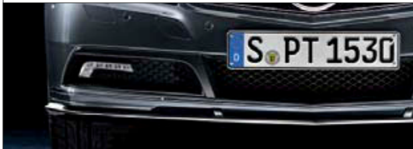
Daytime driving light trim Available in matt black and high-sheen chromed