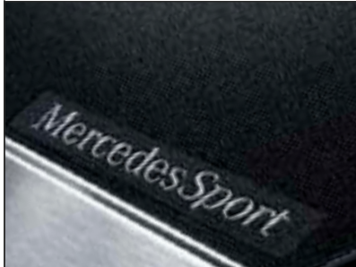
Velour MercedesSport mats A C High-quality sporty look, black with contrasting stitching. MercedesSport lettering on front mats. Set of 4