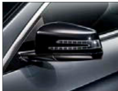
Exterior mirror housings Black. Set of 2