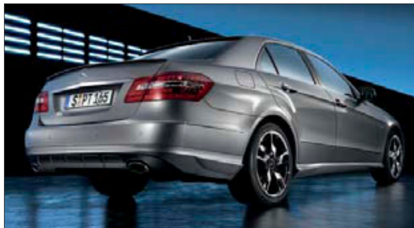
Sporty aplomb in Mercedes-Benz quality: Side sill panels, plus rear spoiler, roof spoiler and diffuser-look rear apron trim [pictured above]

The intelligent design, based on the add-on principle, allows many of the components to be attached without any modifications to the vehicle. This not only conserves resources but is also cost-effective. Your Mercedes-Benz retains its full warranty too – without, of course, the need for additional inspection by the relevant authorities. Showing that impressive design can also be impressive when it comes to practical implementation.