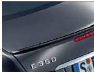
Rear spoiler Primed*