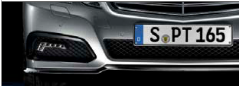
Daytime driving light trim Available in matt black and high-sheen chromed