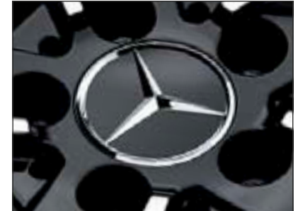
Hub cap A C Black, high-gloss, with chrome star