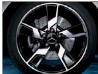
5-spoke wheel, black/two-tone 45.7cm (18-inch). Available with or without MercedesSport lettering