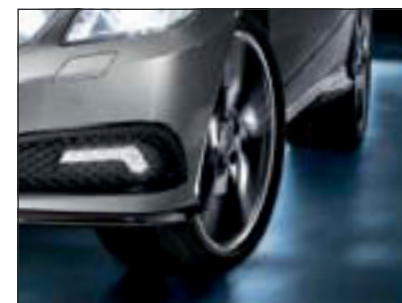
Suspension kit Consisting of dampers and anti-roll bars. Lowering of up to 15 mm (ELEGANCE and entry-level models only)