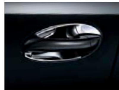
Door handle recesses High-sheen chromed. Set of 4