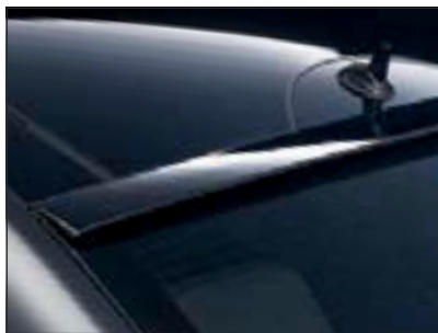
Roof spoiler Primed*