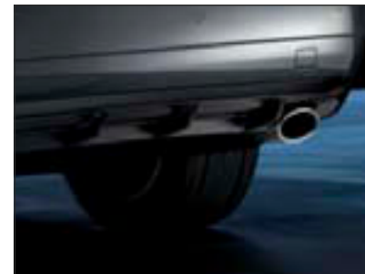
Diffuser-look rear apron trim Primed*